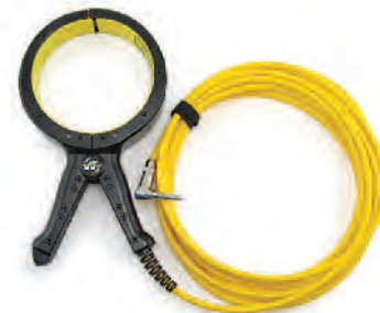
Inductive Signal Clamp: Compatible with all RIDGID transmitters