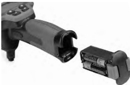
Figure 4 – Battery Compartment