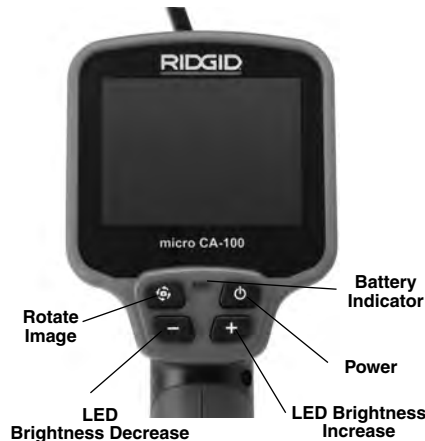
Figure 8 – Controls