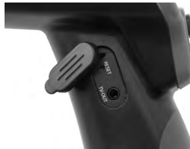
Figure 9 – TV-OUT Jack/Reset Button

Insert the other end into the Video In jack on the television or monitor. The television or monitor may need to be set to the proper input to allow viewing.