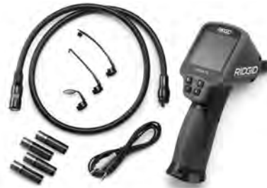
Figure 1 – micro CA-100