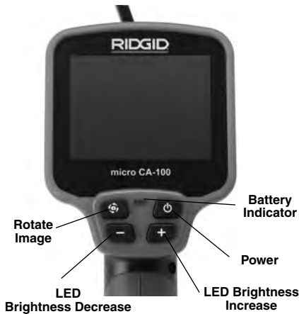
Figure 2 – Controls