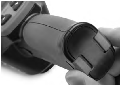
Figure 3 – Battery Compartment Cover