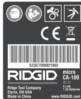
Figure 7 – Warning Label