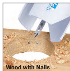
Wood with Nails