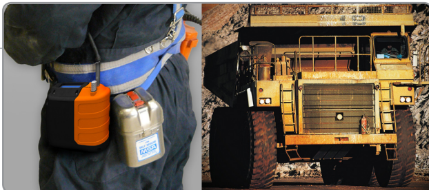
Lightweight and wearable on a belt loop or can be mounted on a vehicle or wall

Includes Airtec monitor, inlet prefilter assembly, five filter cassettes, two prefilter cartridges, USB to mini-USB PC cable, rechargeable battery with 9V/2A Universal AC adaptor (100-240VAC)