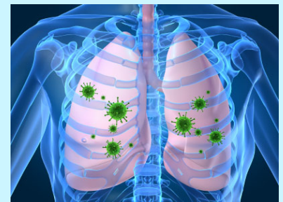
Particulate Matter study