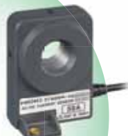
CT686x-10 series 9709-10

High Accuracy Versions of Pull-through Current Sensors