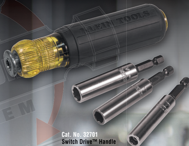
Cat. No. 32701 Switch Drive™ Handle Power Nut Driver Set