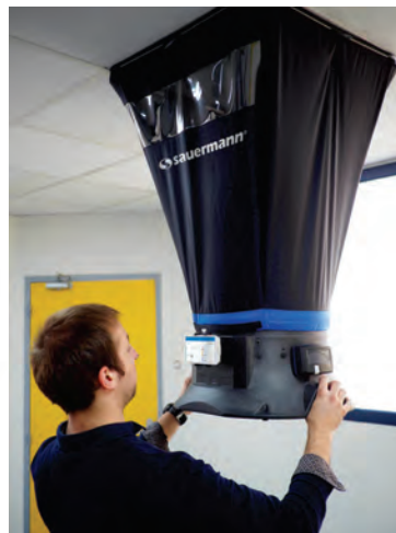
Use of the air flow meter