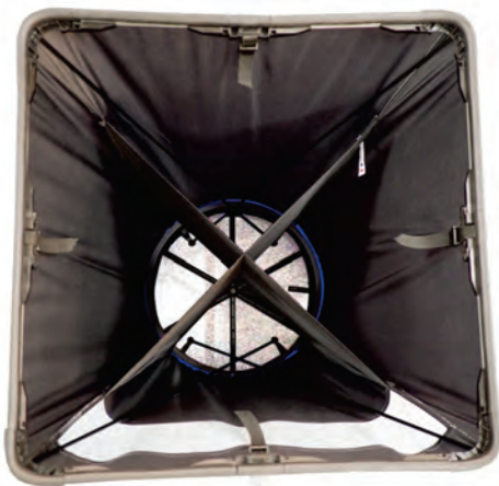
Hood with flow straightener