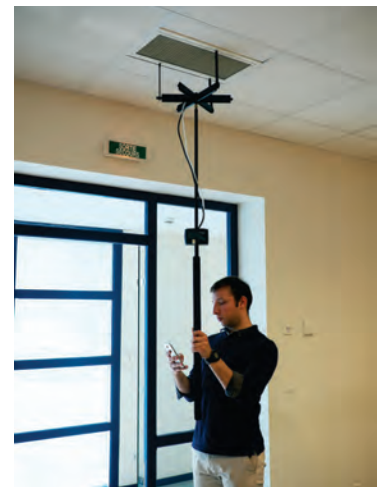
Use with the measurement grid