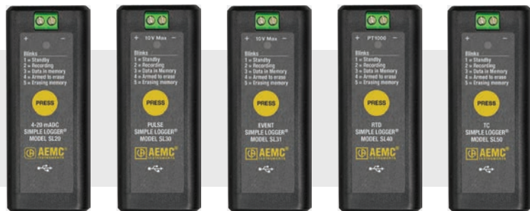
Model SL20 Model SL30 Model SL31 Model SL40 Model SL50

Models available for logging DC Current, Temperature, Pulse and Events