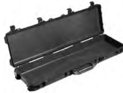
1750NF No Foam