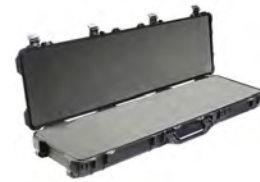
1750WF With Foam