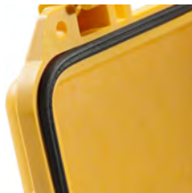
1753 Replacement O-ring