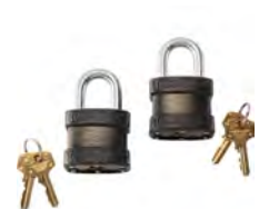
PL2 Padlock (2 pack)