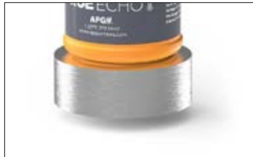
316L SS Threaded Weight