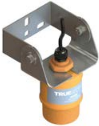
3" Mounting Bracket Accessory