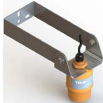
8" Mounting Bracket Accessory