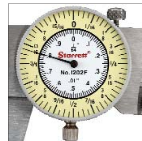
Fractional Dial on the 1202F