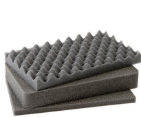
1171 3 pc. Replacement Foam Set