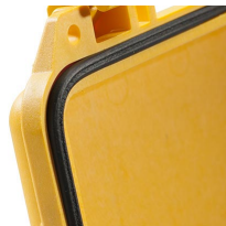
1173 Replacement O-ring