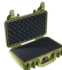
1170WF With Foam