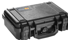
1170NF No Foam