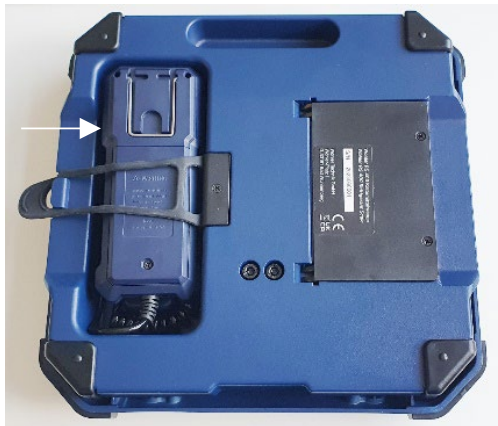
Fig. 7: Underside of the scale with control unit