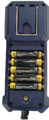
Fig. 8: Back side of the control unit with open battery compartment

When the battery is low, the battery indicator on the control unit display flashes and the weight display may become unstable.