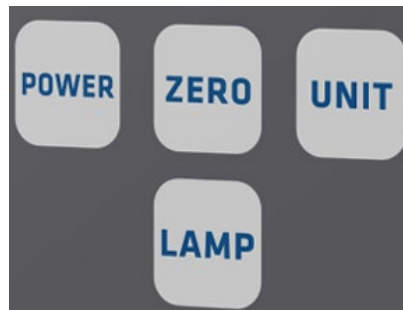
Fig. 6 : Wöhler RS 400