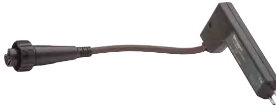
DTP1-C Duplex Twist Probe 1 - Connect Order part number: 1006-449

Spare / optional parts Order part number: Replacement needle tips 2003-551 Waffle / serrated tips 25940-014