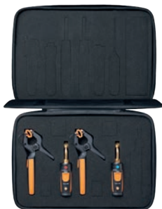
AC & Refrigeration Kit: 0563 0002 20