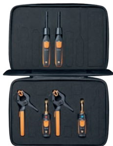
AC/R Test & Load Kit: 0563 0009