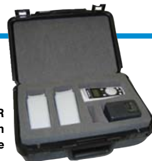
Optional DT-900-PR Professional Kit with Included Case