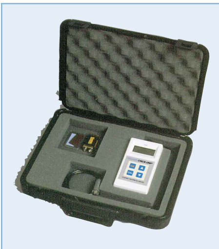
DCF/DCN 900 Complete Kit