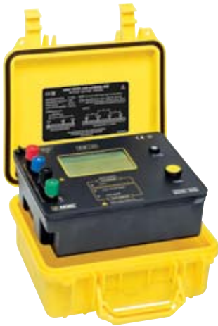
The Models 4620 and 4630 are built into a double case. This extra rugged construction provides double insulation, maximum field durability and ease of serviceability.