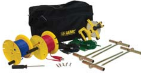
Test Kit for 4-Point testing includes two 300 ft color-coded leads on spools (red and blue), two 100 ft color-coded leads (green and black), four 14.5" T-shaped auxiliary ground electrodes, one set of five spaded lugs, 100 ft tape measurer and carrying bag. Catalog #2135.36