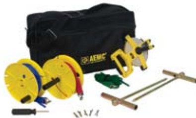
Test Kit for 3-Point testing includes two 150 ft color-coded leads on spools (red and blue), one 30 ft lead (green), two 14.5" T-shaped auxiliary ground electrodes, one set of five spaded lugs, 100 ft tape measurer and carrying bag. Catalog #2135.35