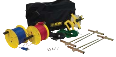
Test Kit for 4-Point testing includes two 500 ft color-coded leads on spools (red and blue), two 100 ft color-coded leads (green and black), one 30 ft lead (green), four 14.5" T-shaped auxiliary ground electrodes, one set of five spaded lugs, 100 ft tape measurer and carrying bag. Catalog #2135.37